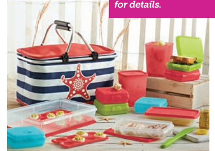
16-Pc. Seashore Picnic Set

Congratulations! Register now for Jubilee @ exclusive rate. Just add 1 registered recruit to qualify. See reverse for details.